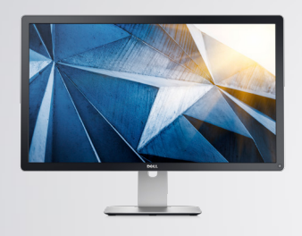
Dell 32 UltraSharp Montor - UP3216Q