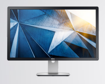
Dell 32 UltraSharp Montor – UP3216Q