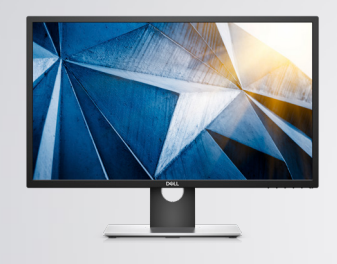
Dell 27 UltraSharp 4K Monitor – U2718Q